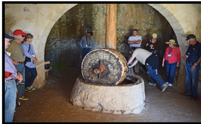
Olive press in Nazareth