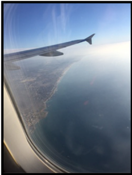
Tel Aviv Israel from plane