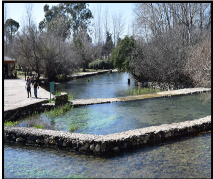
Where Peter proclaims Jesus to be the Christ